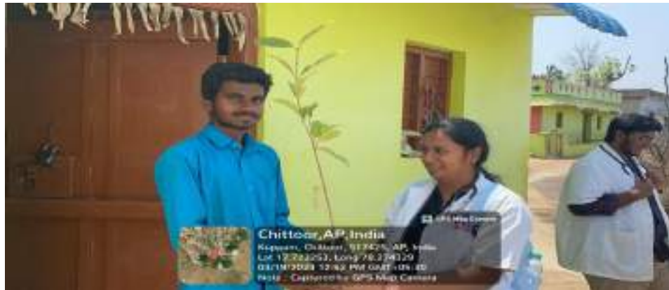
PESIMSR NSS Unit Special camp on March 2024 at Chittoor to create awareness among the people about important of tree plantation