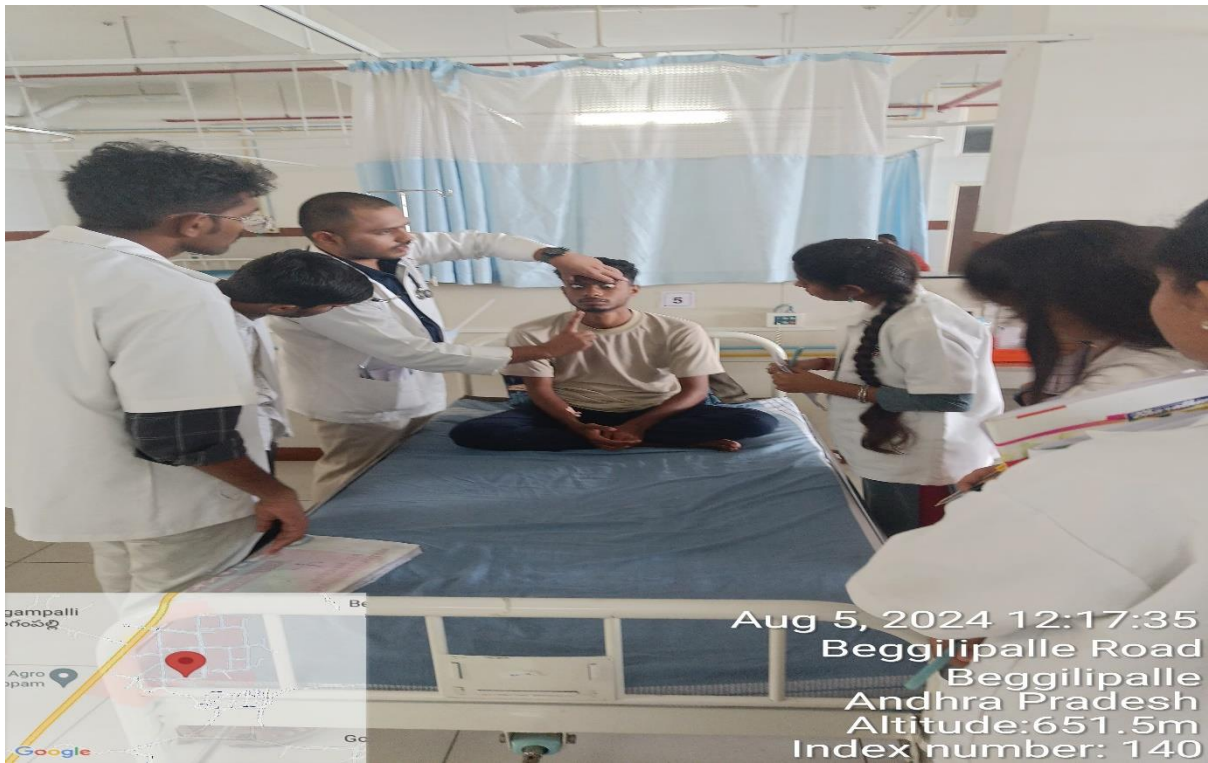
CASE BASED LEARNING