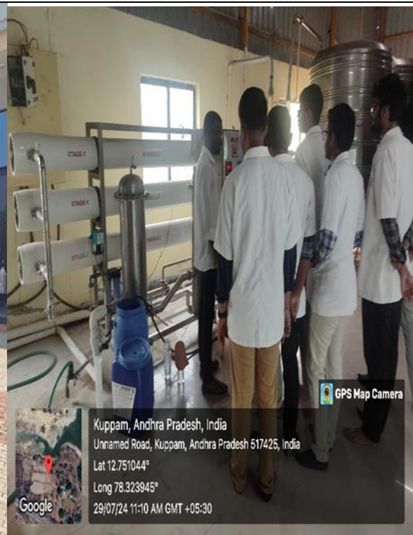
Water treatment plant- purification