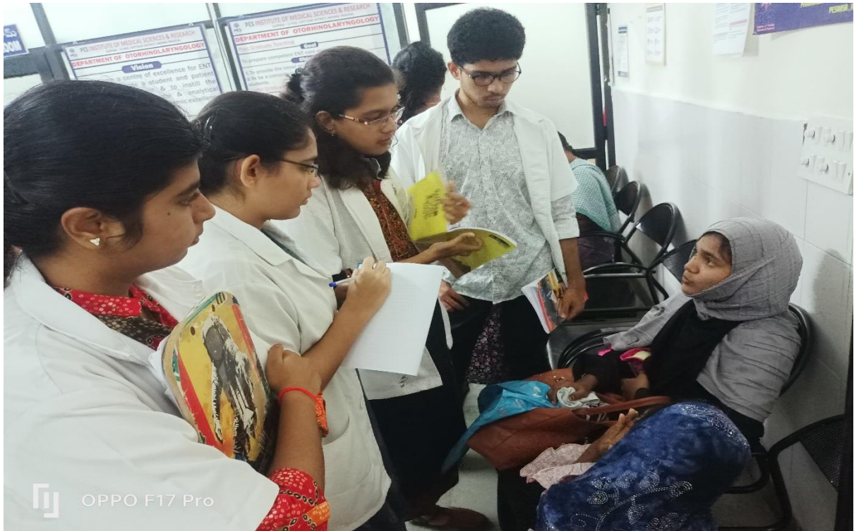
PATIENT CENTRIC LEARNING