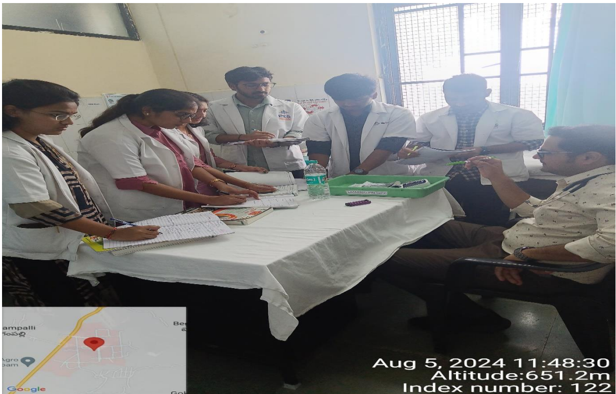
SELF DIRECTED LEARNING