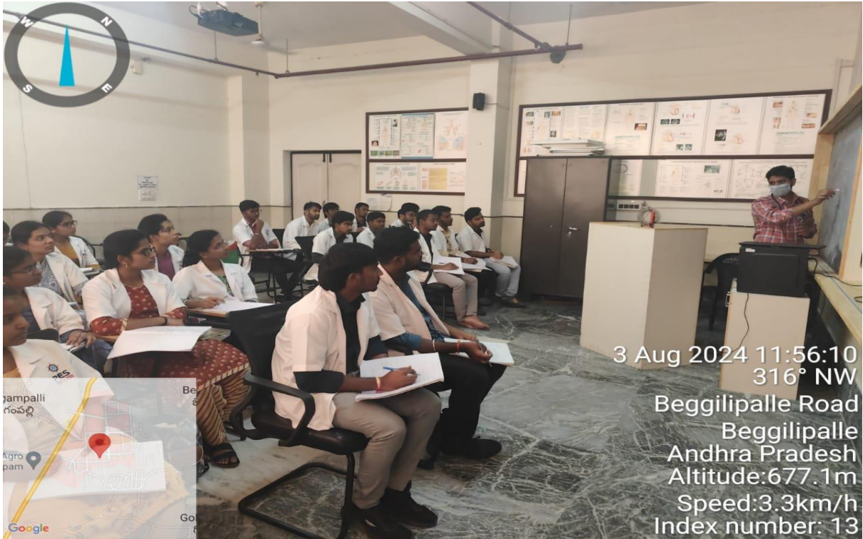
SMALL GROUP DISCUSSIONS