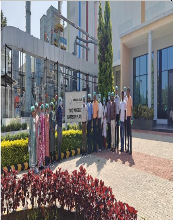
Amara Raja battery factory -occupational health