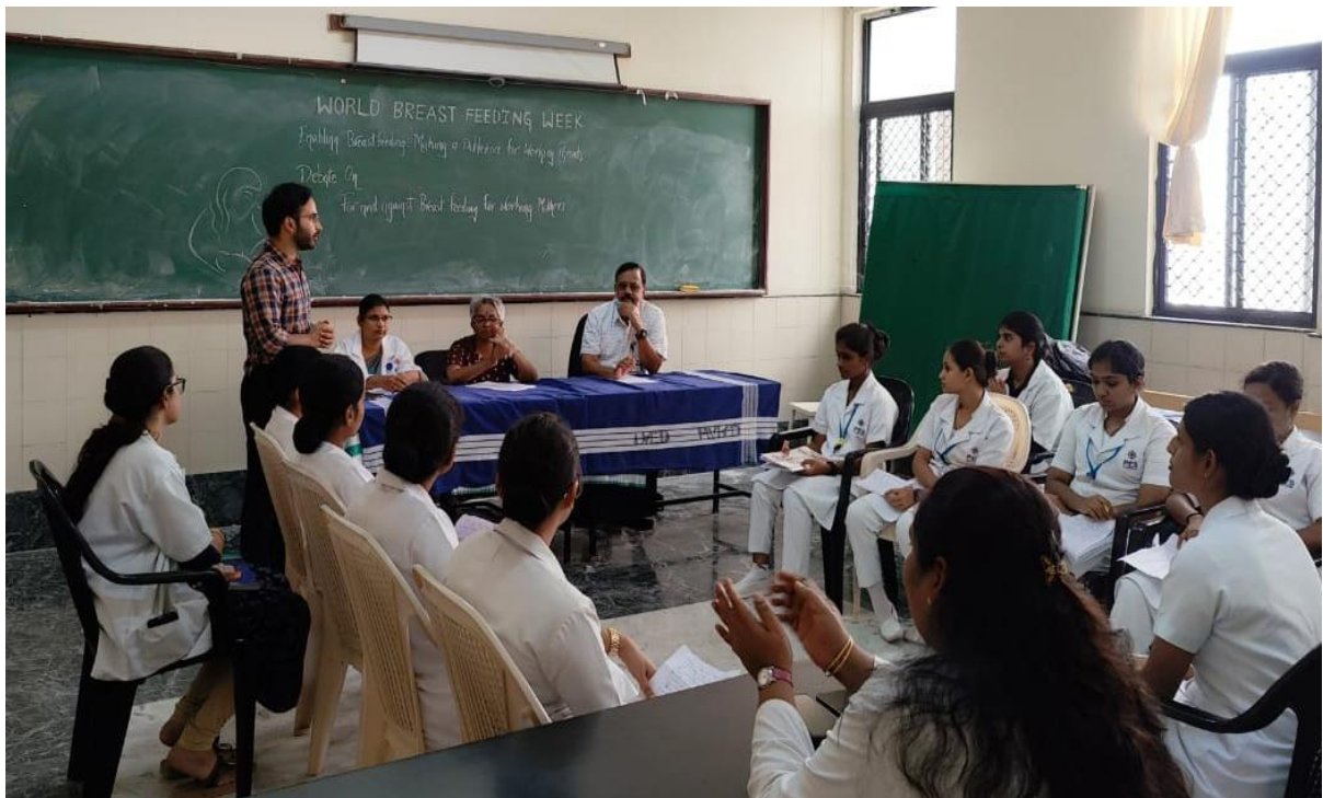
Debate: Breast Feeding Triumphs over Infant Milk substitute ( medical students Vs nursing students)