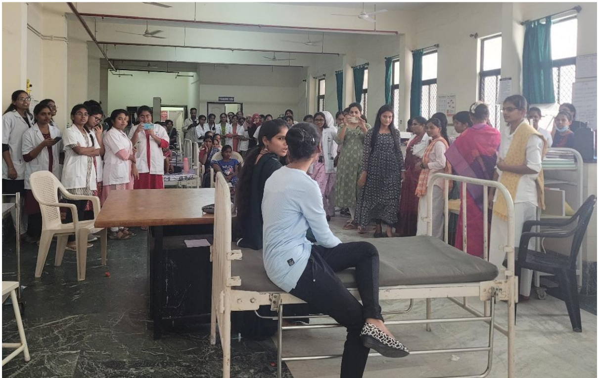
Role play by students on ill effects of bottle feeding and faulty feeding in Paediatric ward