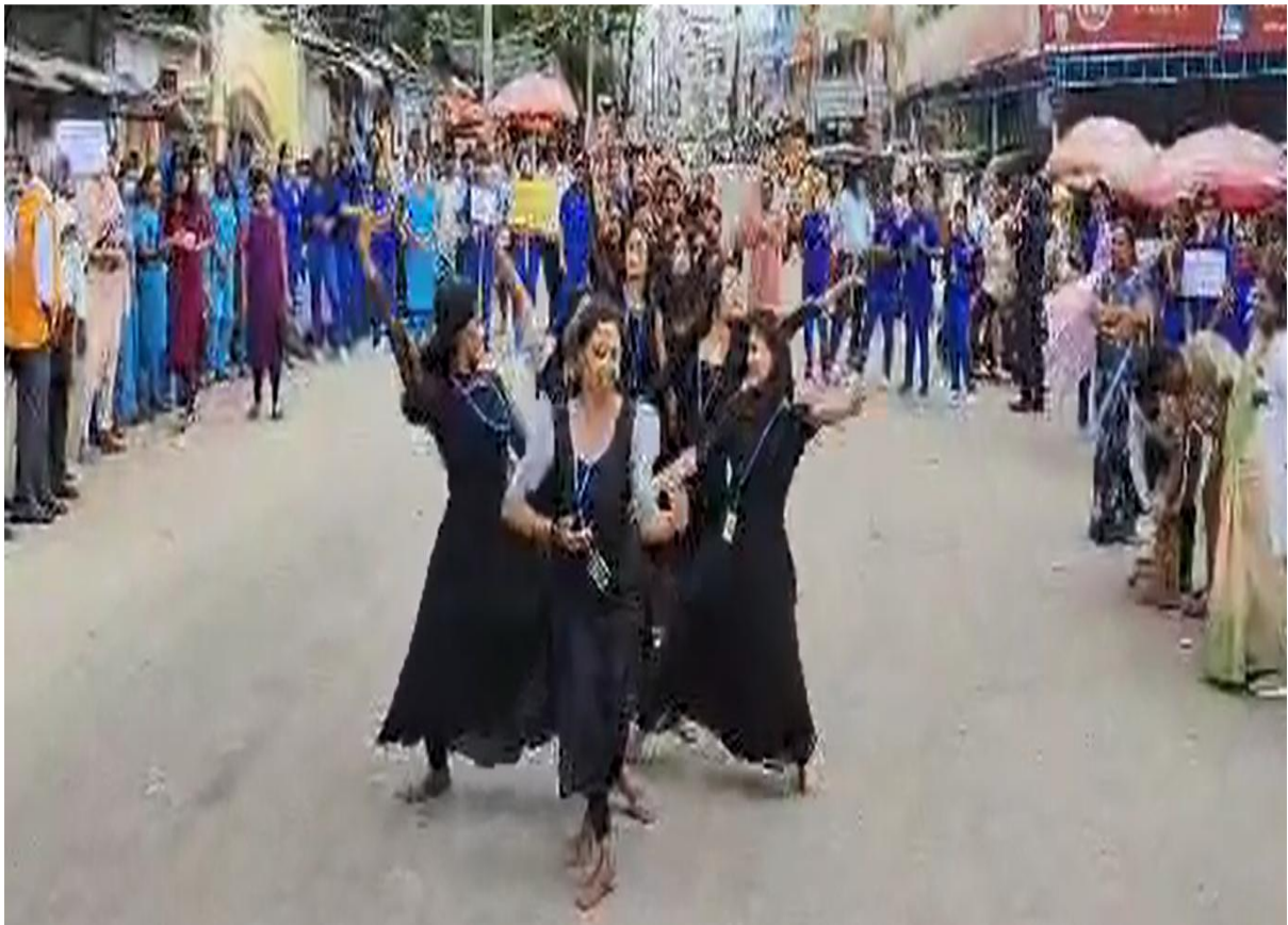
STUDENTS PARTICIPATING IN WALKATHON AND FLASHMOBS