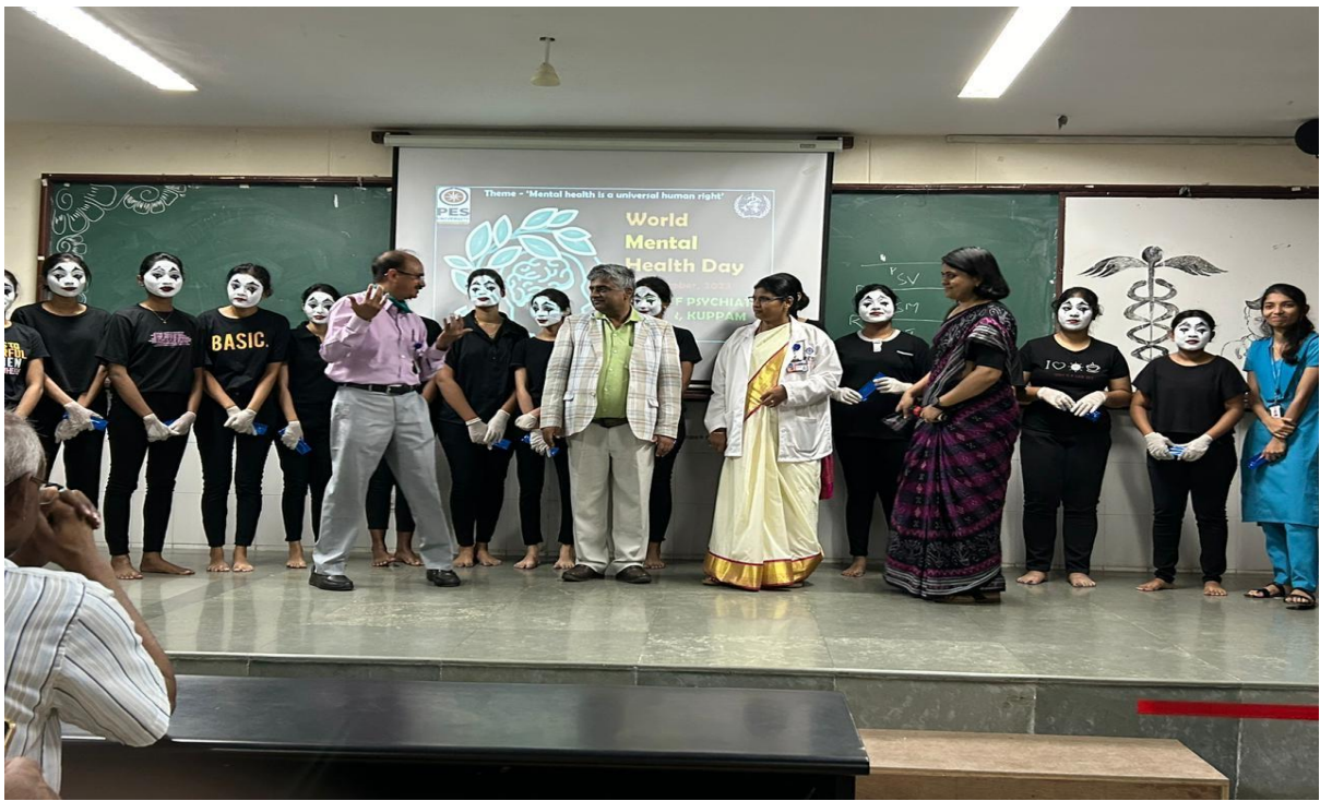
WORLD MENTAL HEALTH DAY- 2023