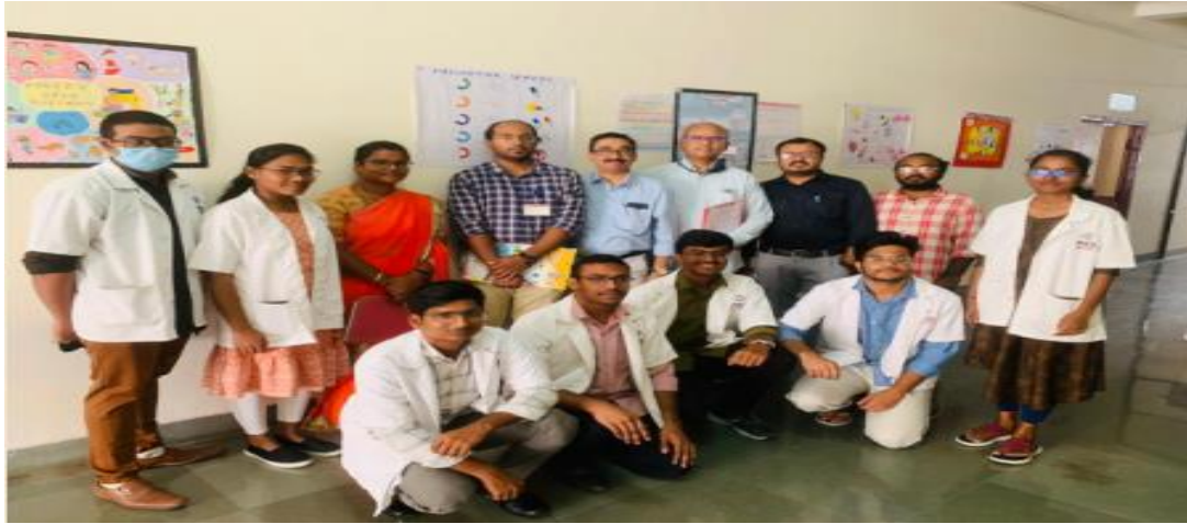
Poster/ Painting winners with Judges