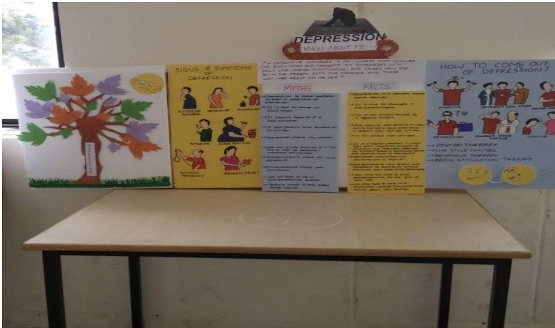
WORLD MENTAL HEALTH DAY- 2019