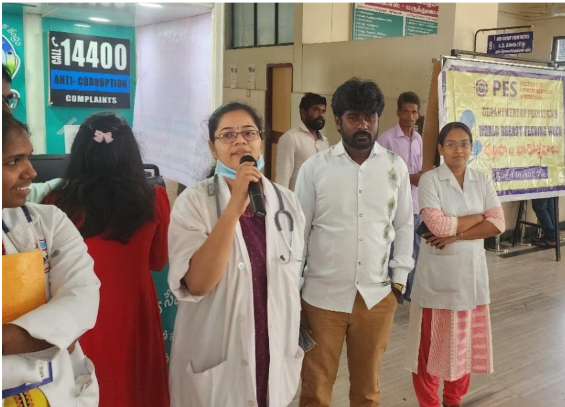
HEALTH EDUCATION GIVEN BY STUDENTS