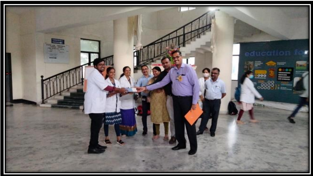
National Pharmacovigilance Week, Medication safety, Public awareness (17th to 23rd Sept 2022)